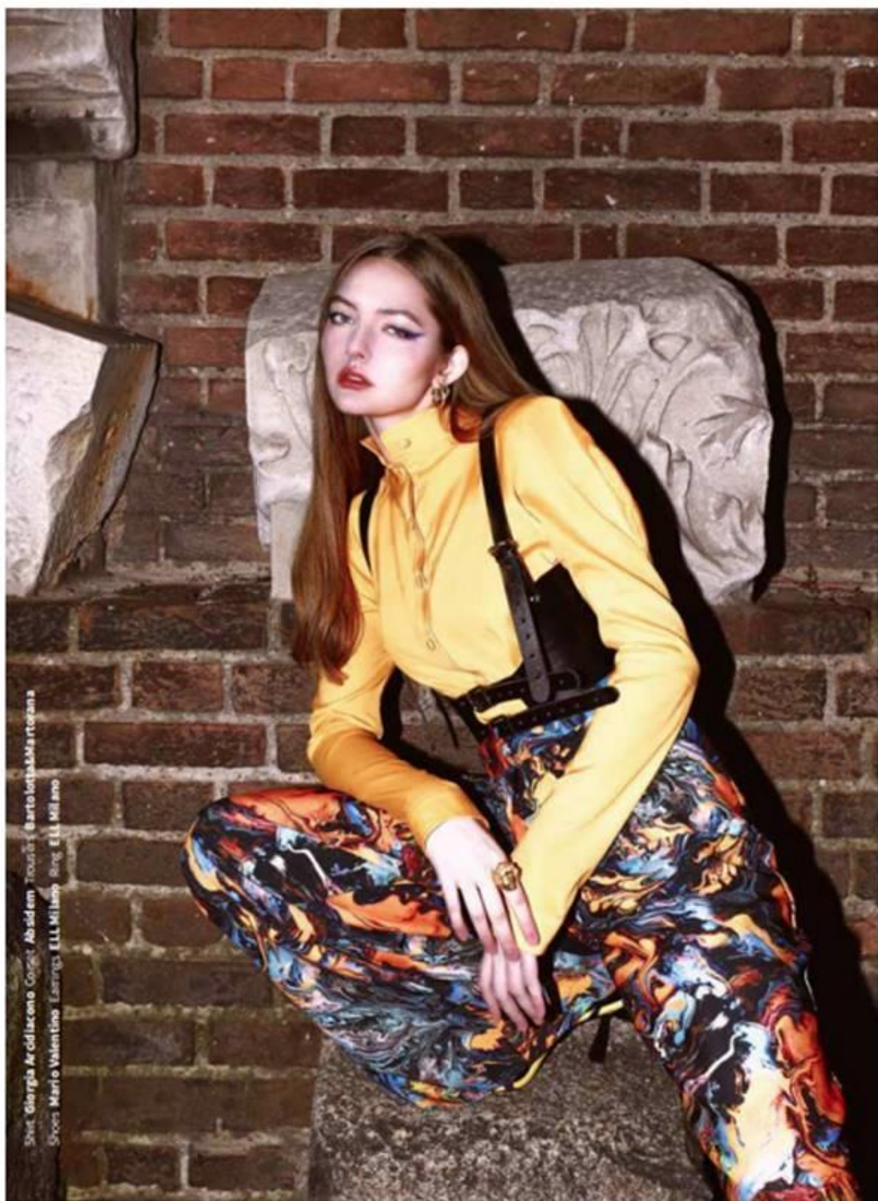
Shirt: Giorgia Arditaceno - Coat: Absid em - Trouser: BartolottaMartozana Shoes: Mario Valentino - Lingerie: ELL Milano - Ring: ELL Milano