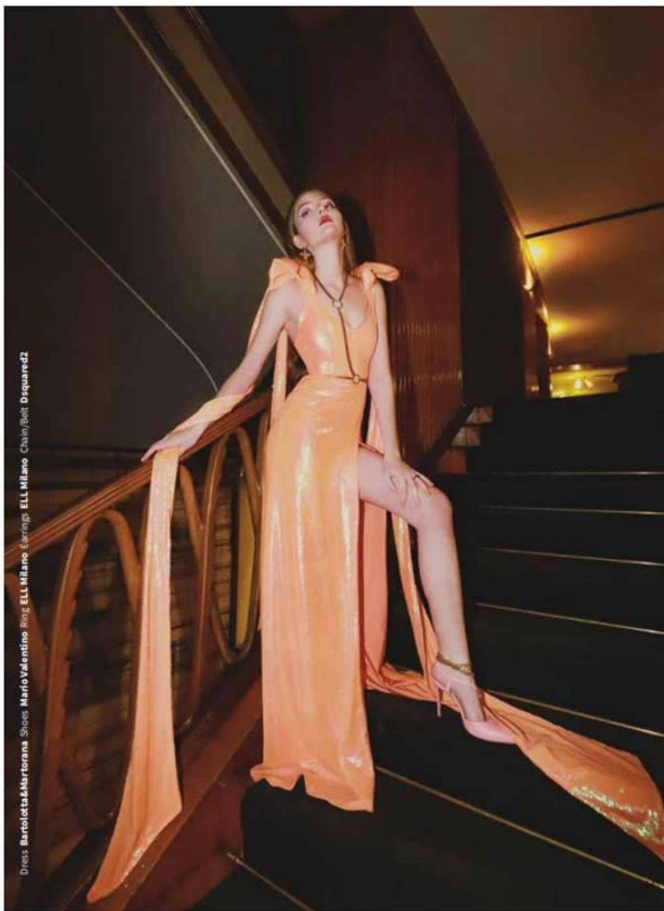
Dress: Bartolotta&Martorana Shoes: Mario Valentino Ring: ELL Milano Earrings: ELL Milano Chain/Belt: Dsquared2