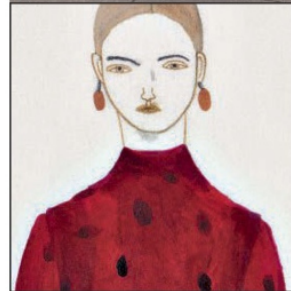
1. Casadei. 2. My Boutonnière. 3. Sergio Rossi. 4. Antonello Serio. 5. Ayala Bar. 6. Primadonna Collection. 7. Pregunta. 8. Ripani. 9. Valleverde. 10. Mario Valentino. 11. Lebole Gioielli. 12. Street style in London. 13. Street style in New York. Artwork Frida Wannerberger.