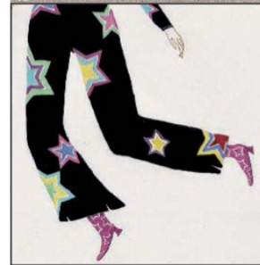
1. Calicanto. 2. Versace. 3. Ripani. 4. Bimba Y Lola. 5. Cinzia Valle. 6. Gedebe. 7. Pregunta. 8. OGM Plant. 9. Christian Louboutin. 10. Safsafu. 11. The Attico. 12. Street style in Milan. 13. Street style in Milan. Artwork Frida Wannerberger.