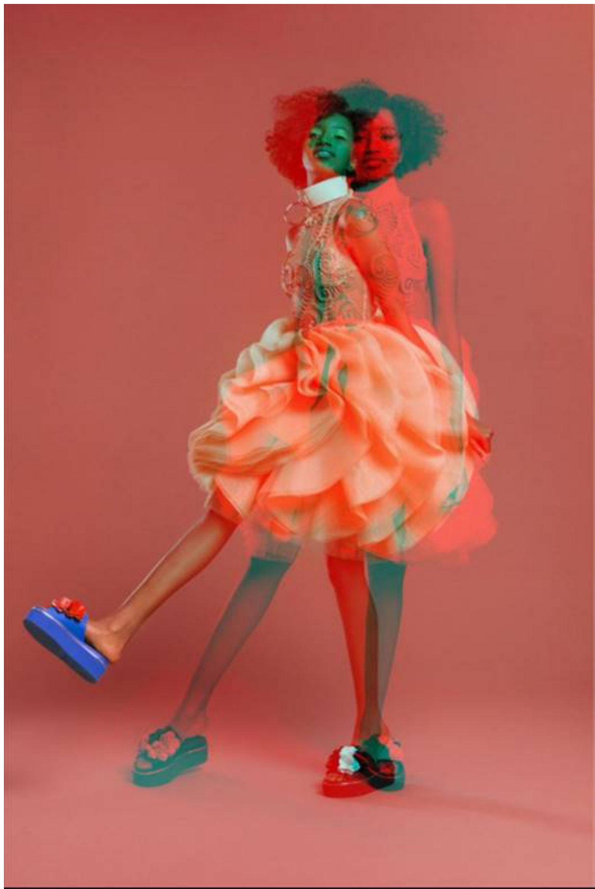
Dress BARTOLOTTA E MARTORANA Choker ABSIDEM Footwear MENGHI